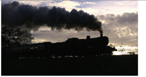
The 7F passes Watersmeet near Bishops Lydeard a little while after sunset with a Santa Special working on 27th November 2005.